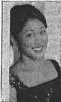
Kristi Yamaguchi is married to Bret Hedican, who plays for the Carolina Hurricanes.

"I've only been to Raleigh a few times for the shows,"